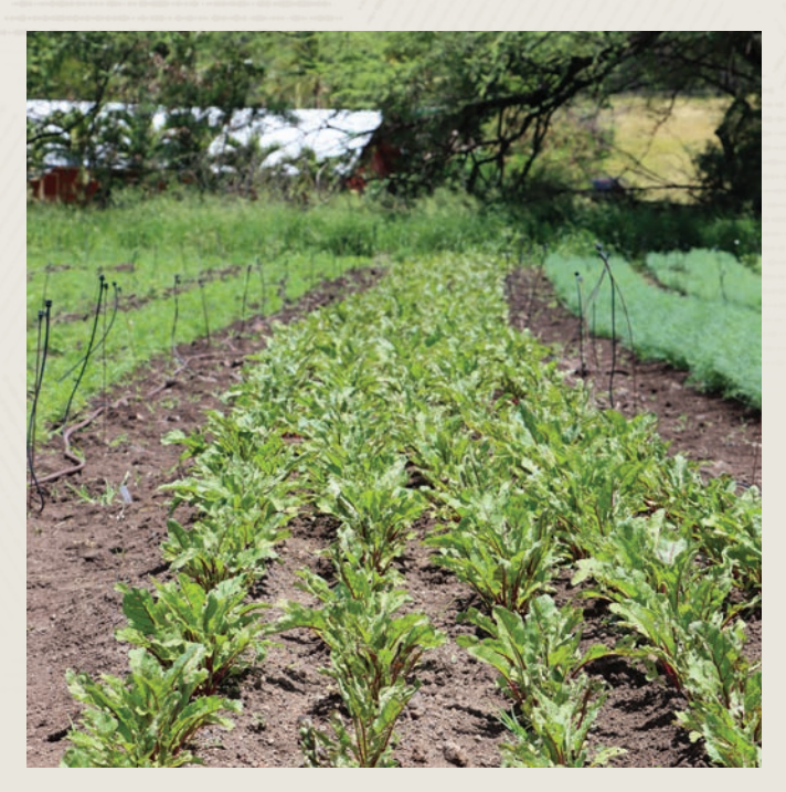
Kahumana Farms uses regenerative agricultural practices that improve soil health, sequester carbon, and improves nearby ecosystems.

production to 150,000 pounds of food annually for the local market, including Community Supported Agriculture (CSA) boxes, value-added products, healthy school lunches, and farm hub, which primarily serves new and socially disadvantaged farmers.