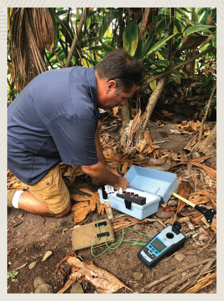
A turbidity meter is used to measure the prevalence of particles suspended in water. This helps us to understand the impacts and benefits of our work on the land downstream and in the ocean.