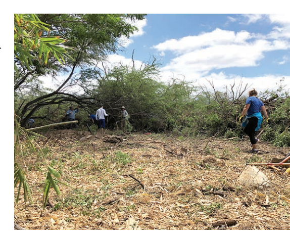
Volunteers work to clear and restore Lāʻie wetlands in Kīhei, Maui

Through a generous grant from the County of Maui, HILT staff and volunteers are also working in partnership with the Save the Wetlands Hui in Kīhei to begin the process of restoring the Lā'ie wetlands, a culturally and ecologically significant wetland located near the heart of Kīhei. Work began in earnest on Friday morning August 21<sup>st</sup> when, on an exceptionally hot day, a group of 12 volunteers gathered to remove highly aggressive, and ecosystem modifying, invasive species from the wetlands. In preparation for restoring the health and integrity of these wetlands, over 500 seeds of the native sedge, Kaluhā, were collected nearby and are growing at our Waihe'e Refuge nursery for future outplanitng, probably during the ho'oilo, or wet season.