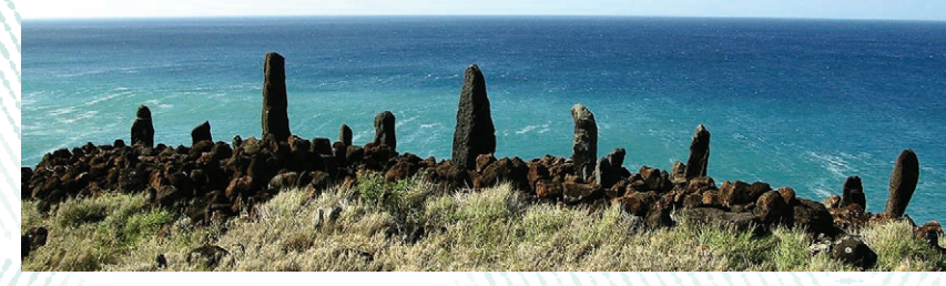
Upright põhaku at Koʻa Holomoana heiau at Māhukona provide guidance to traditional navigators.