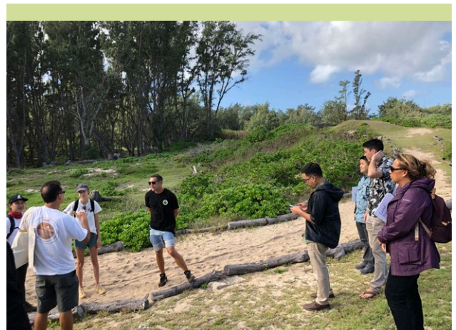
At Kalaekaua'oa or Kahuku Point on O'ahu's North Shore, North Shore Community Land Trust, partners, funders, and elected officials join a site visit to learn about the native restoration efforts.

However, community members should be keep in mind that land trusts and community groups are separate entities with their own decision-making processes. Land trusts can work with and provide community groups with information, and make recommendations or suggestions, but land trusts do not make decisions for the community. By the same token, land trusts have their own by-laws and