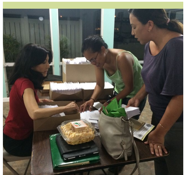
Ka Iwi Coalition volunteers and land trust staff work into the night to mail requests for the last funds needed to complete Ka Iwi Coast's protection.