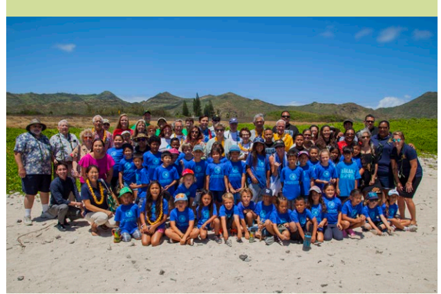
Ka Iwi Coalition, Mālama Hōnua Public Charter School, The Trust for Public Land, elected officials, agency leaders, and Maunaloa and Waimānalo community members celebrate Ka Iwi Coast Mauka Lands' protection.