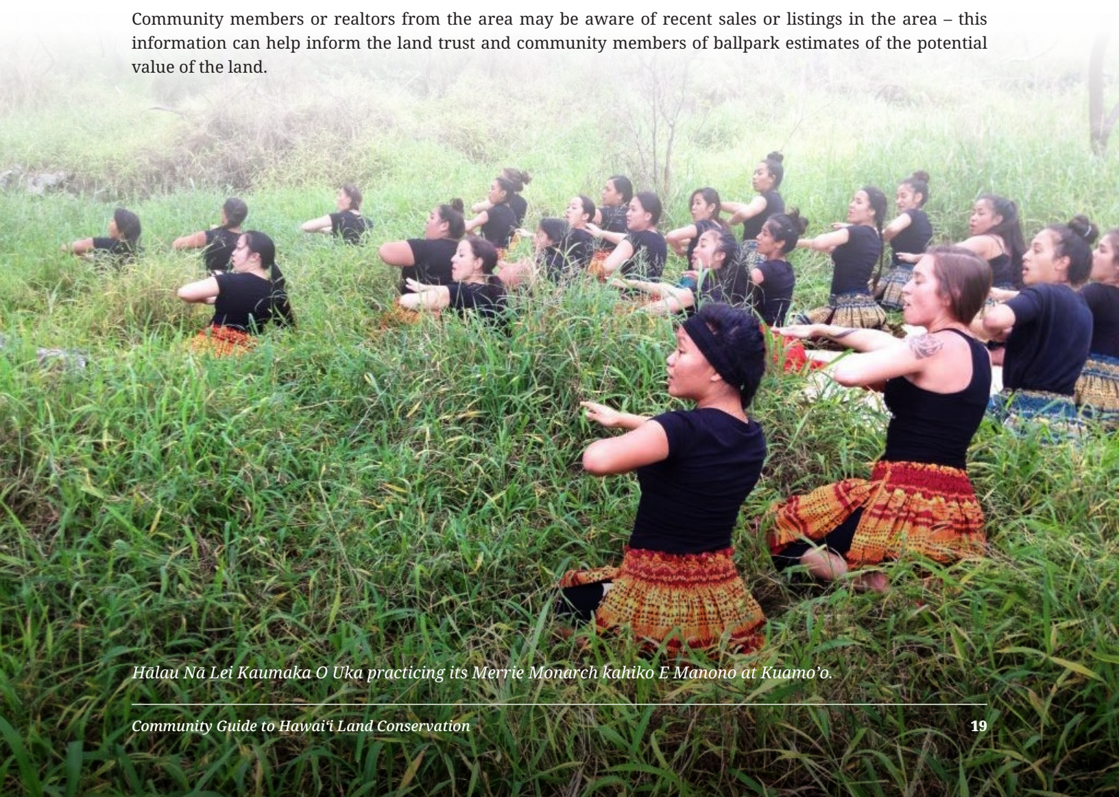
Hālau Nā Lei Kaumaka O Uka practicing its Merrie Monarch kahiko E Manono at Kuamo'o.

Community members or realtors from the area may be aware of recent sales or listings in the area – this information can help inform the land trust and community members of ballpark estimates of the potential value of the land.