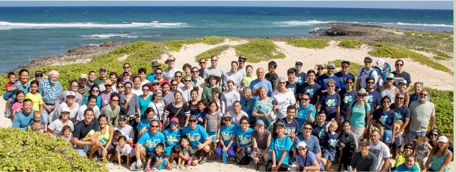
Volunteers gathered to steward Kahuku Point/Kalaekauna‘oa