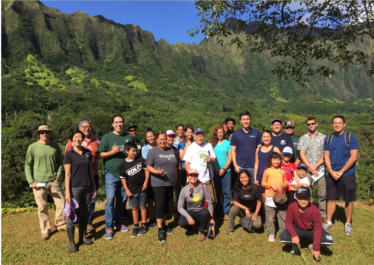
Kāne'ohe community leaders, State DLNR staff, land trust staff, farmers, elected officials, and keiki gather to learn about and plan for the future of the lands behind them.