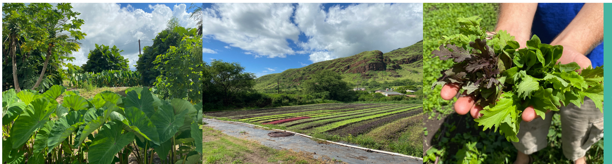
1. Dryland kalo growing 2. Rows of salad and herbs 3. Freshly picked salad